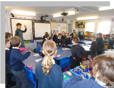
Spanish and flamenco dancing

The children enjoyed a variety of activities yesterday as part of our new style Enrichment Day. Children had lessons in mindfulness, alternative sports, cookery, music, foreign languages and outdoor education. Here are a few images of the day.