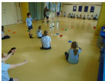
PE Alternative Sports