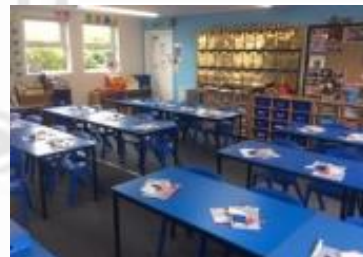
Otter Class (Year 5)