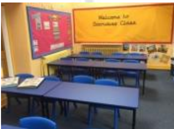
Dormouse Class (Year 1)