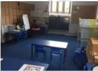
Fox Class (Year R)