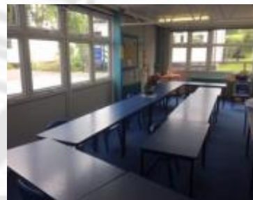
Hedgehog Class (Year 6)