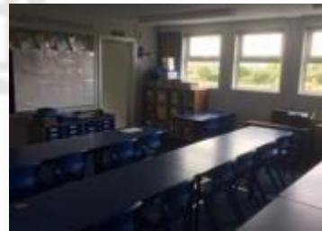
Squirrel Class (Year 4)