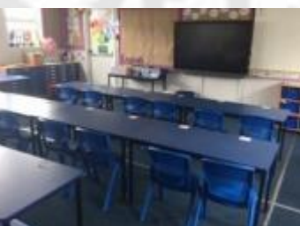
Hare Class (Year 3)