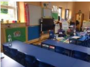
Mole Class (Year 2)