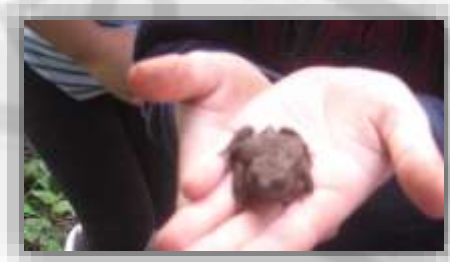
Mole Class had a 'croaking' time in Forest School on Thursday. They even found a toad!!!