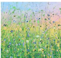
One of the prints which will be on sale

A new pop-up shop is opening on Taunton's High Street which will be stocked and run by students from special schools selling products and beautiful artwork they have made. The project is a joint initiative with the youth charity Young Somerset which is providing expertise and support. Taunton Dean Council has helped locate the shop and the landlord has given the premises for free. This is the culmination of extensive long term work the council is undertaking with Special Schools to support young people and their families to work towards a future that includes meaningful employment opportunities. There's a grand opening at the shop — 56 High Street, Monday November 19. Thank you, Mrs Clarke