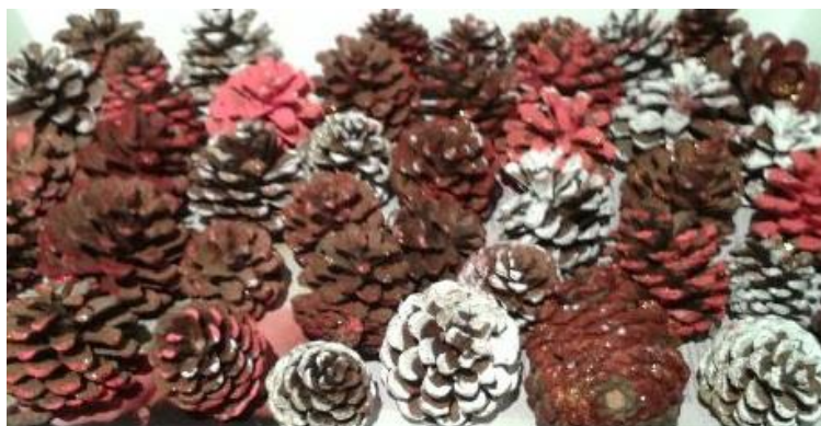
The pine cones so wonderfully painted by reception class for Santa's Grotto!! I've never seen such beautiful pine cones!

With this in mind, please can you refrain from parking by the large vehicle gates outside of school. This area needs to be kept clear for emergency vehicle access and to ensure the safety of pedestrians visiting the school.