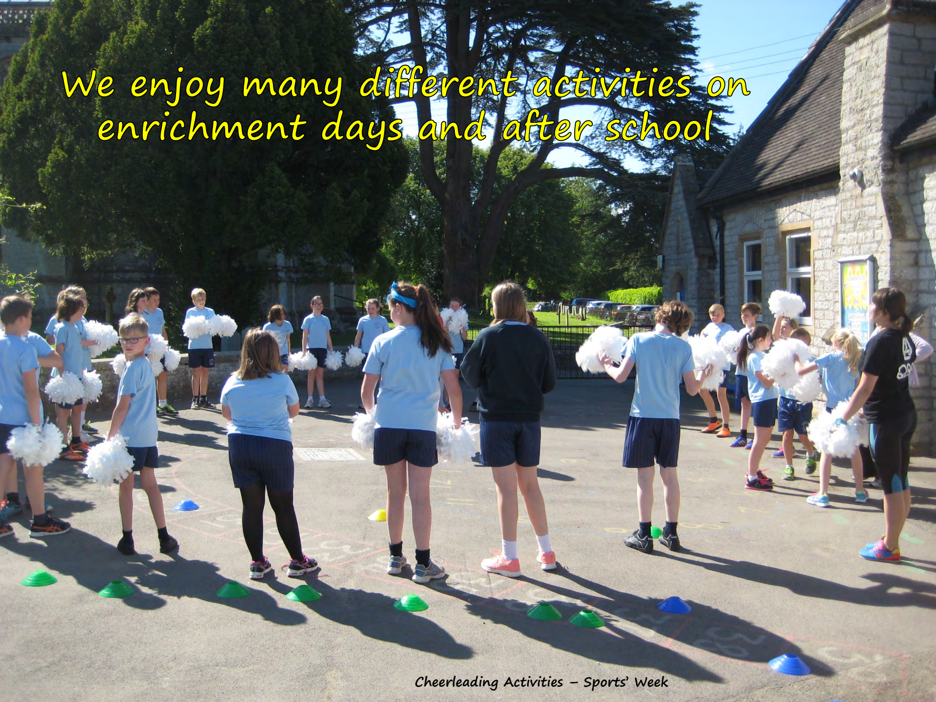
Cheerleading Activities – Sports' Week

We enjoy many different activities on enrichment days and after school