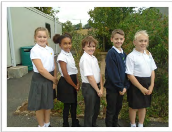
Our House Captains

We encourage children to take on additional responsibilities to develop confidence, communication, teamwork and leadership skills. The children at West Pennard are proud of their school and take their responsibilities very seriously. Every class has 'greeters' that welcome visitors to their class and explain their learning and the learning environment. We also have opportunities for children to become peer mentors, part of an active school council, a member of the IT support team or even a House Captain. We also have a Head Boy and Head Girl who will take pleasure in showing you around our forward thinking school.