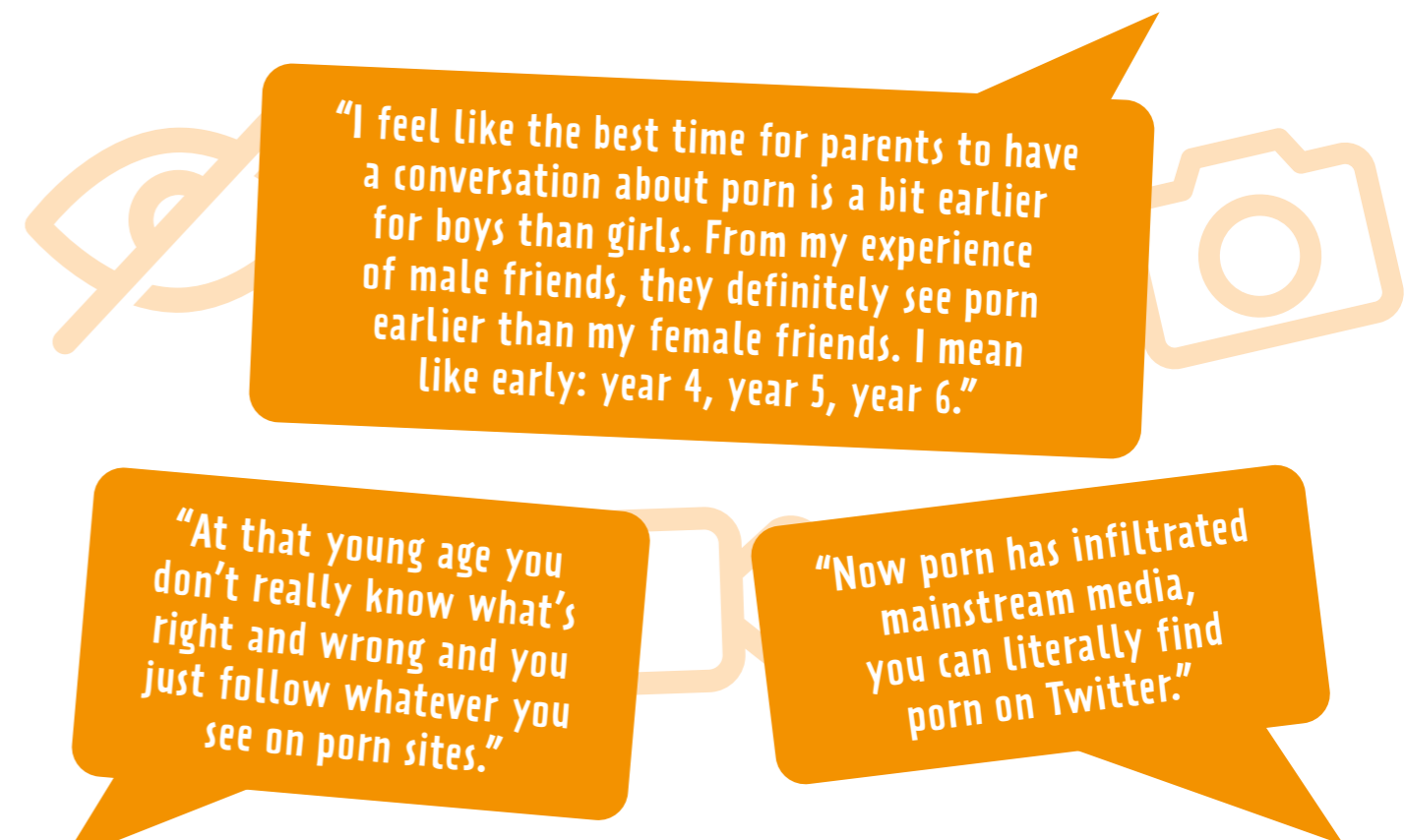
All quotes from young people aged 16-21

Click here to go to our resources page for more information