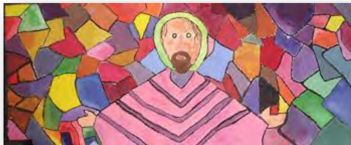
Images, clockwise from top left Banner produced as part of our 'Hopes and Dreams' production Christmas Carol Service in St Nicholas' Church

Praise plays an important role at our school. Our approach is to promote self-esteem through praise of the children and to give our children an understanding of the religious act of praise as a Church of England school.