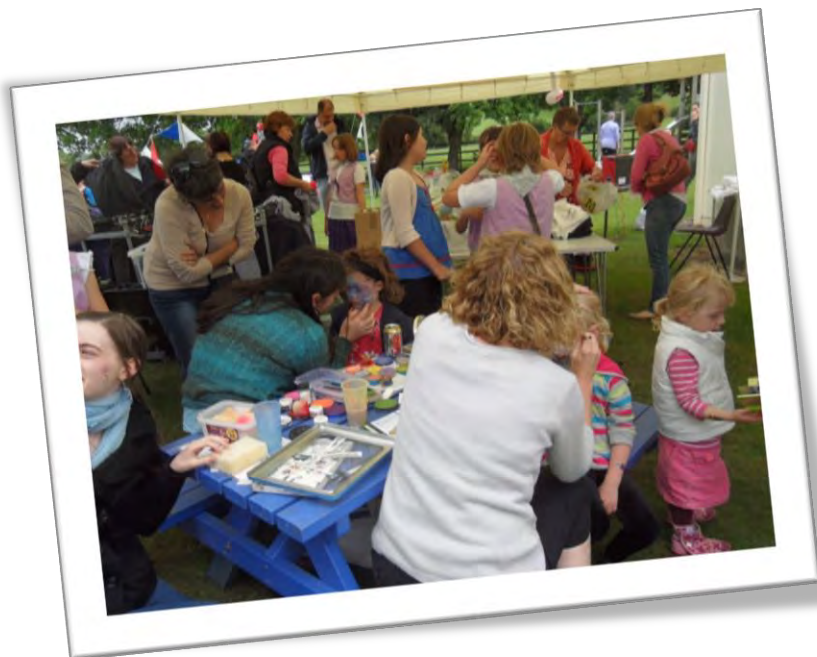
Images, clockwise from top left St Nicholas' Church, West Pennard, Summer Fair

Under the 1988 Education Act, religious education should be predominantly Christian and most work relates to the Christian tradition and festivals but older children are offered opportunities to learn about aspects of other world religions, traditions and mythologies. Parents have the right to withdraw a child from religious education and any parent wishing to withdraw a child from this area of the curriculum should make a written request to the Head.