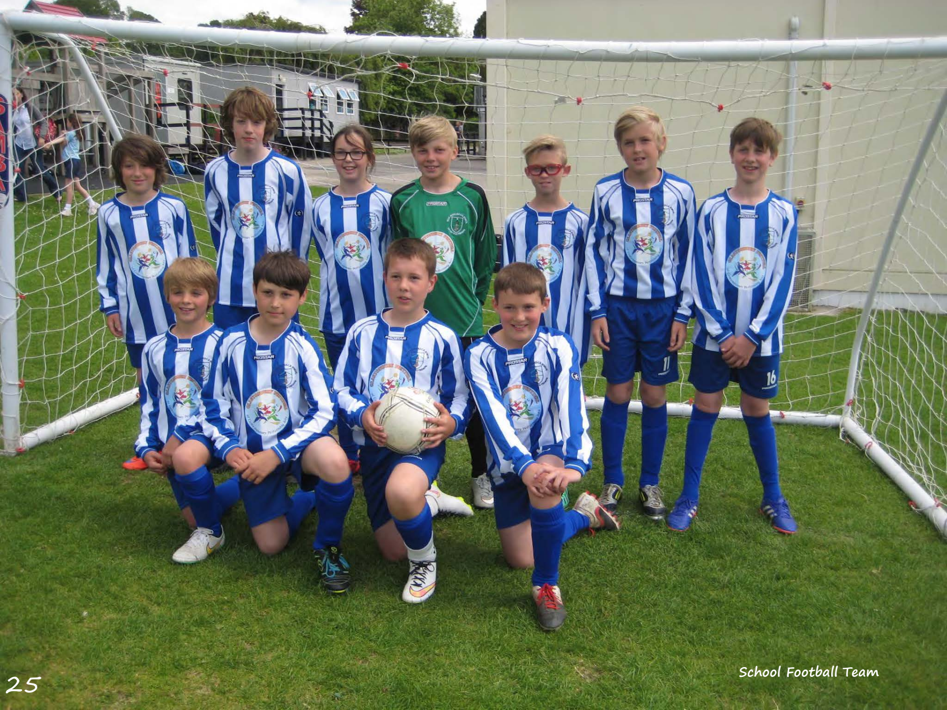
School Football Team