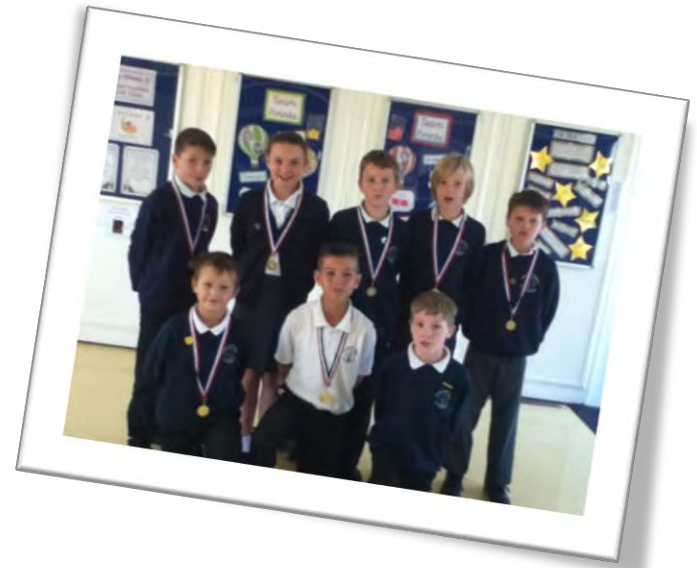
Images, clockwise from top left Winners of a school basketball tournament Year 1 at Glastonbury Abbey

We provide a wide range of extra curricular clubs. The activities in the lunch hour and after school vary from term to term. They include chess, dance, country dancing, animation, programming, robotics, basketball, multiskills, gymnastics, netball, athletics, cricket, football, cross country, cooking, street-surfing, running, taekwondo, rugby, weaving words, drama, sewing, story treasure chest and computing. Children also compete against other schools in a number of events. We have a thriving school choir which performs in Wells Cathedral and at Strode theatre.